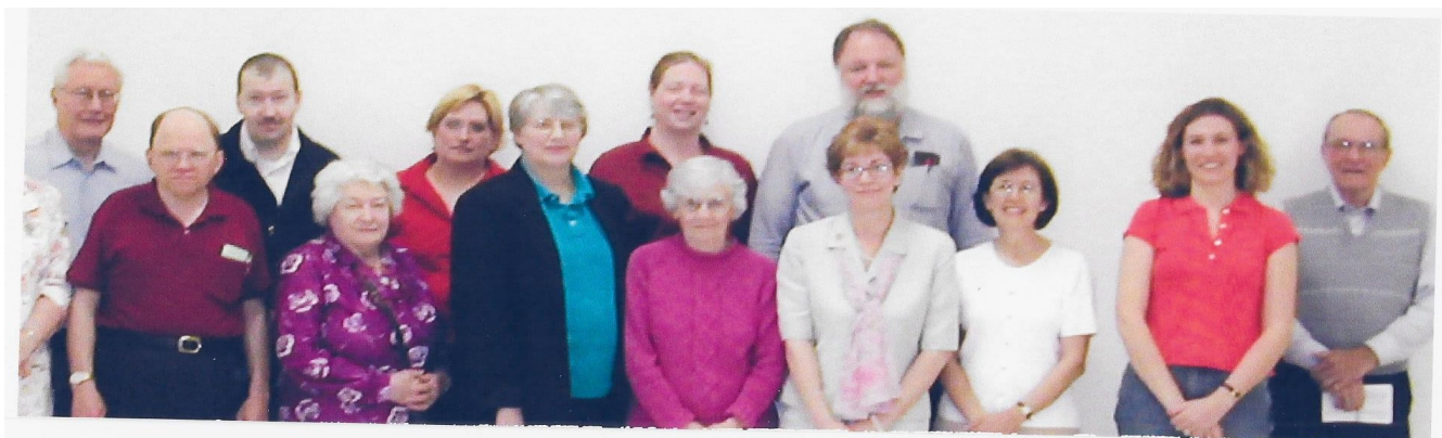
Members of the FCS Board - early 2000s