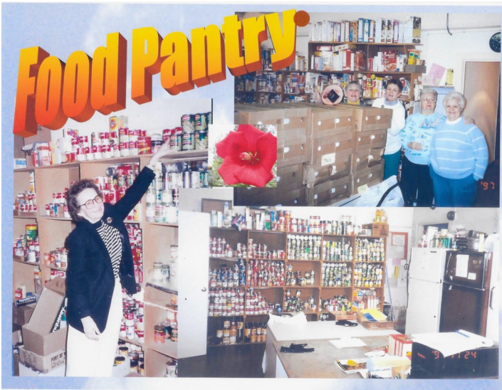
Some old food pantry photos