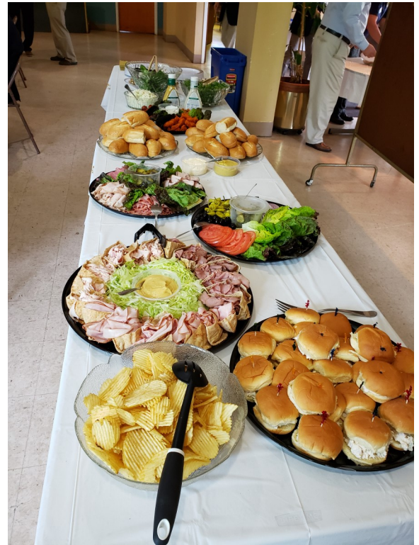
FCS Appreciation Luncheon and Fiftieth Anniversary Celebration, April 30, 2019