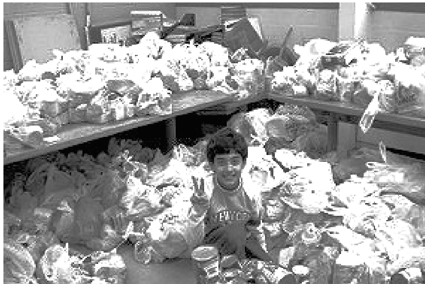
Kingsley Community 4-Her helps sort Thanksgiving food for FCS. The 4-H Club was one of several groups who helped sort the Boy Scout food donations.